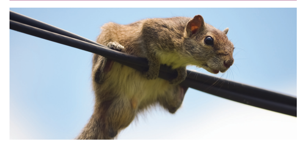
Squirrels, birds and limbs are the most common culprits of power blinks.

In today's modern household, there are many electronic devices to keep protected, and a momentary blink in power is enough to disrupt our everyday needs and activities.